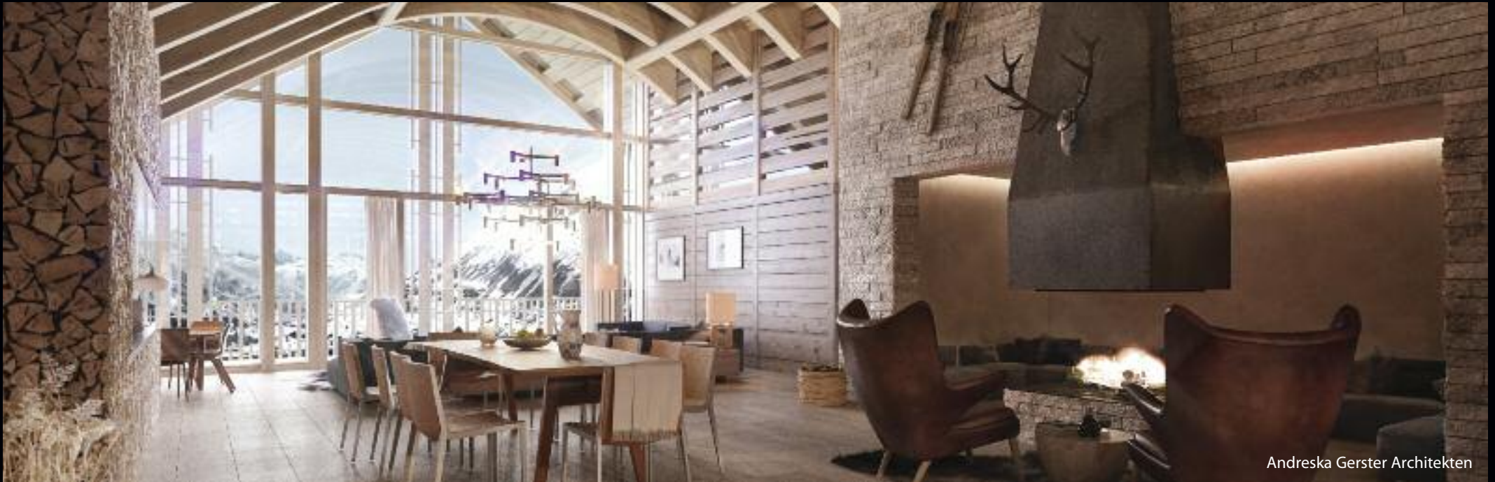
Andreska Gerster Architekten